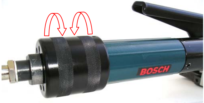
THE CHOKE COLLAR COULD BE TURNED IN BOTH WAYS